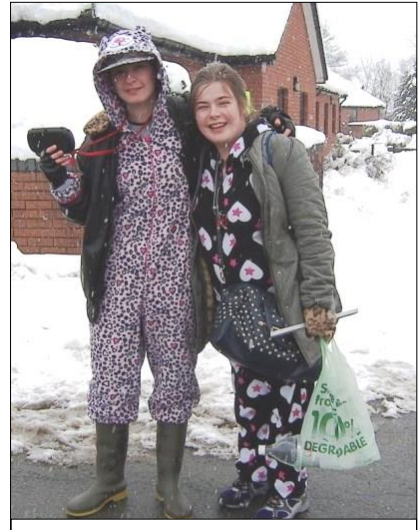
Two students walked in their onesies

The Friends of the Derwen lead the fundraising for the College and for the last two years have been raising funds for a new Chalet at Barmouth which was opened at Easter this year. It has been a real favourite with students and has been fully used during the whole summer.